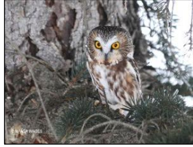
N. Saw-whet Owl May Haga

As a volunteer or participant in the activities of the Saskatoon Nature Society (SNS), you are fully responsible for your own safety, and for your own personal insurance in case of injury. Please exercise great caution and care on field trips or any other outings. The Saskatoon Nature Society is not responsible for damage incurred to vehicles or other personal property while participating in any SNS activity. If going onto private land, always ask for permission, be friendly and respectful, exercise caution, and please be aware that participants may be responsible for damage to landowners' property.