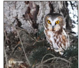
Northern Saw-whet Owl May Haga

If interested in attending an evening session, Phone Marten Stoffel at 306-230-9291 and ask for available dates and times.