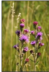
Meadow Blazing Star K. Meeres