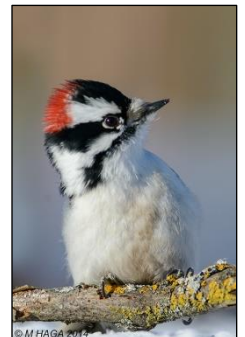
Male Downy Woodpecker

LATER WINTER OUTINGS. Please check January newsletter.